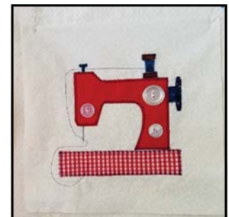
Block of the Month appliqué.